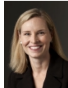
Mary Louise Kelly