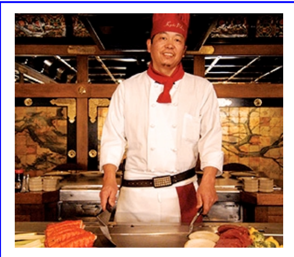
Proceeds from this event support Local Scholarships given to West Valley College women majoring in Science or Math or a related field.

Sunday, October 16, 2011 12 noon to 3:00 pm Second floor – Pruneyard Shopping Center 1875 South Bascom Ave, Campbell, CA (at the corner of Campbell and Bascom Avenues)