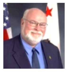
Senator Jim Beall