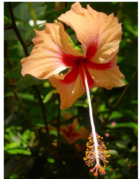
Taken in Costa Rica