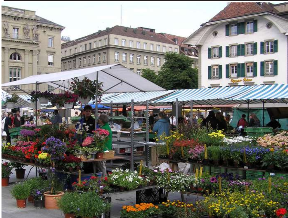
Flower Market in Switzerland