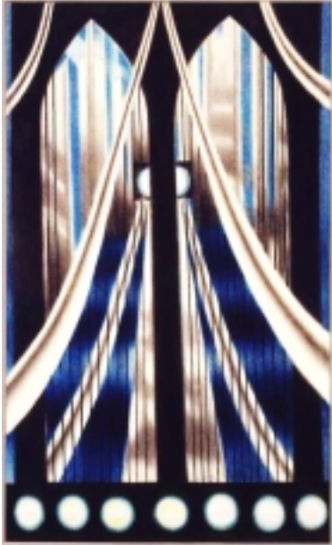
Bridge, 1936, by Joseph Stella