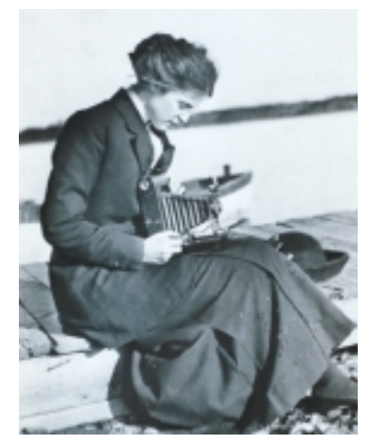
"There are two ways of spreading the light to be the candle or the mirror that reflects it." -Edith Wharton

As debate in congress picks up steam, AAUW believes we must advocate to our members of Congress. Tell