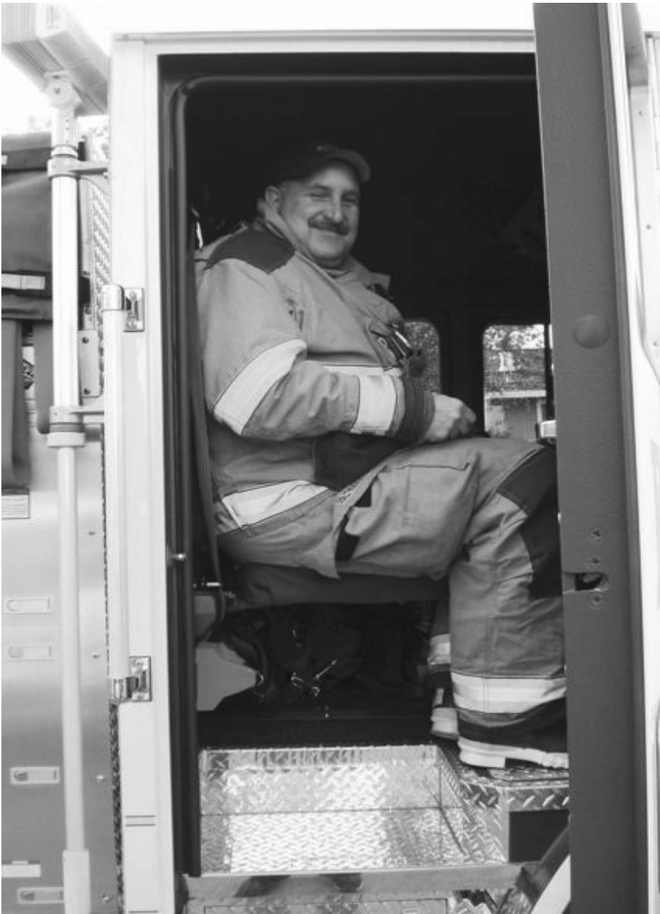
Firefighter demonstrates the fire engine to members of Being on Your Own