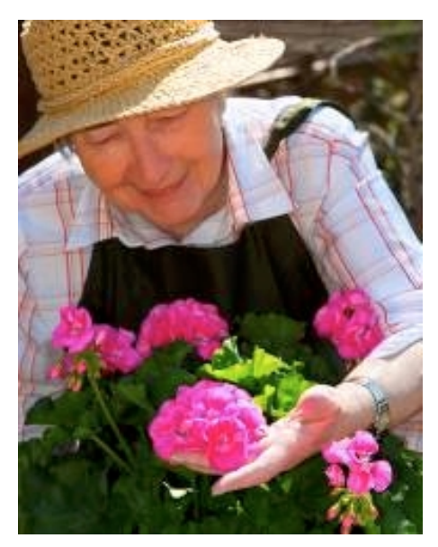
Co-sponsored by Los Gatos-Saratoga AAUW and El Camino Hospital, Los Gatos