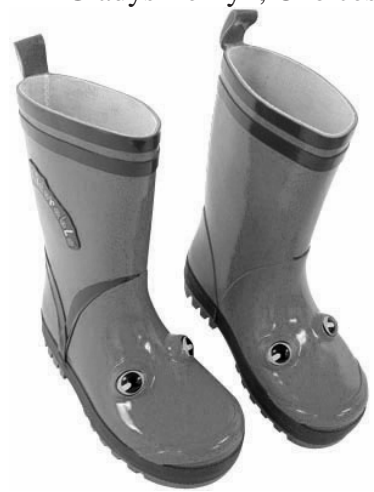
Boots to match the rain slicker!