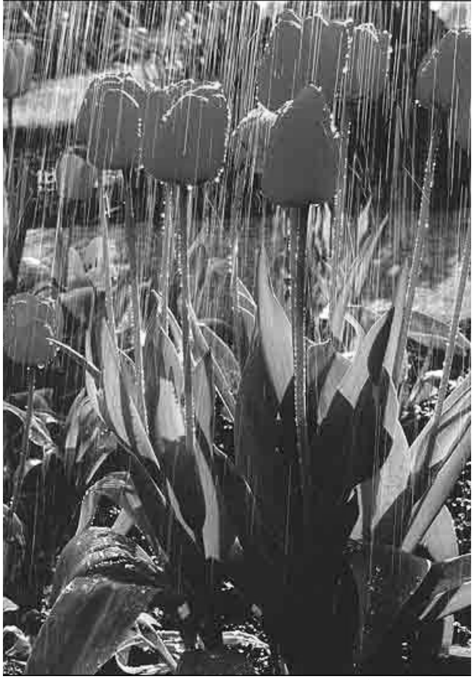
Tulips in the April rain.

(http:// pacificnw.naturephotographers.net/ locations/skagitvalley/